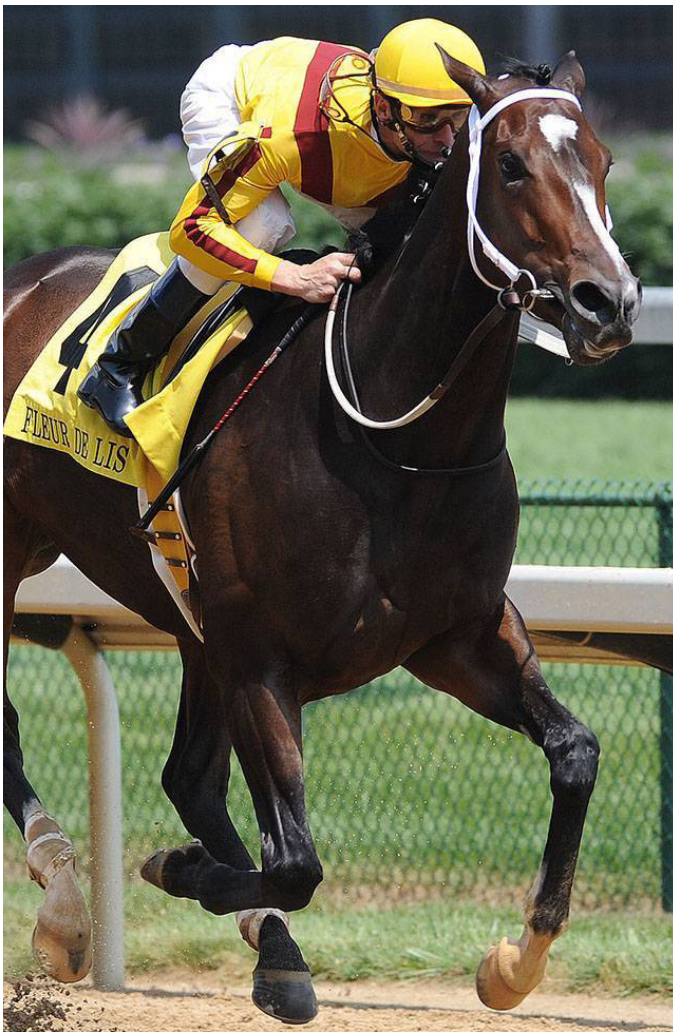
Sage Intacct integrates information and allows Stonestreet Thoroughbred Holdings to stay perfectly synchronized.