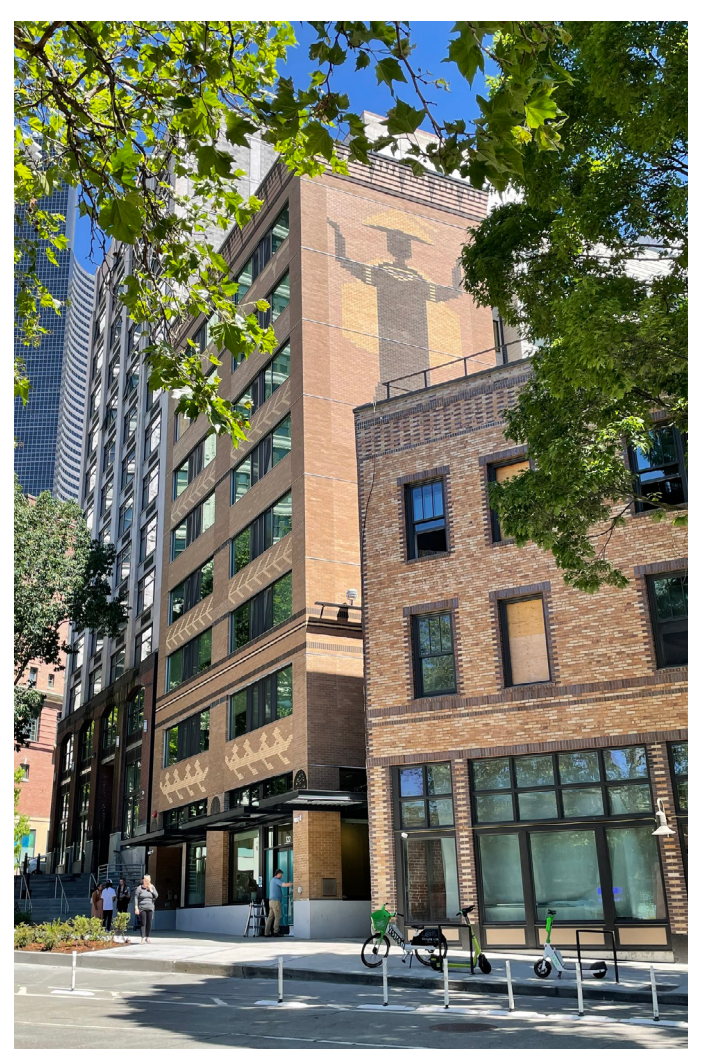
Sage Intacct helps Seattle Indian Health Board improve the welfare of the community.